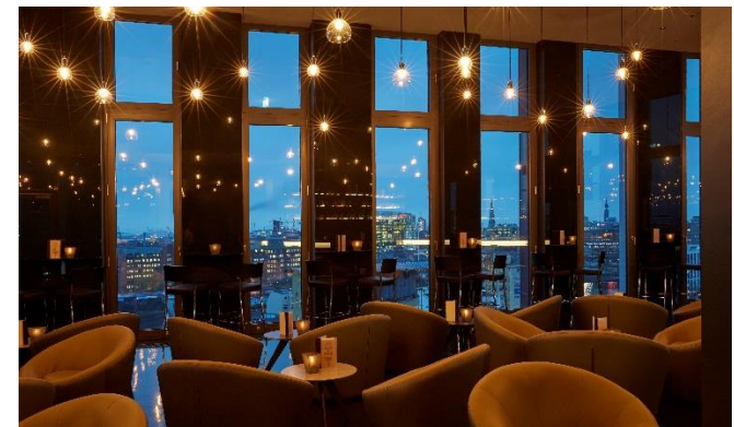
BAR 11 on the 11 th floor of the Hyperion Hotel Hamburg